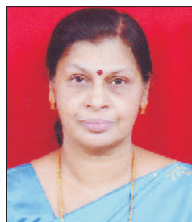
Pouly Baby Group E - 2nd Rank